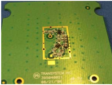
Fig-2 : LNA

For EB-230, both passive antenna and active antenna can be used. However, active antenna is recommend for optimal receiving performance. Please use active antenna with 15~20dB gain, Noise Figure less than -1.5dB.